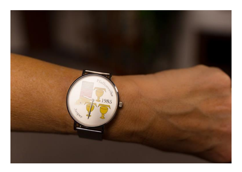
These watches bearing the logo of the Sister Cities Program were created to celebrate the 35th anniversary. A special clock featuring the same logo was gifted to Jasper recently.

As part of the anniversary activities, the Pfaffenweiler Partnership Commission hosted members of the Jasper Partnership Commission, Sister Cities of Jasper, and the Jasper German Club in an engaging brainstorming session centered on how to continue strengthening the relationships between the two communities.